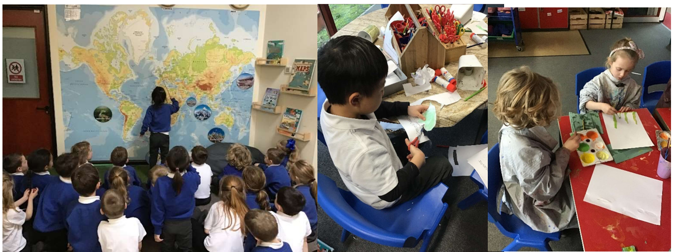
Geography – world map in the Hive; making shamrock clovers and painting daffodils as the national flowers of Northern Ireland and Wales.

In English we have written invitations to a party for the toys in our story 'Toys in Space'. In Maths we have been learning to count in 5s, noticing the patterns with the numbers. This week in Geography we have been recapping our knowledge of facts about the four countries of the UK we have learnt this term and have been learning our final facts about the three seas that surround the UK. We really enjoyed finding the UK on our big world map in the Hive. We thought the UK seemed so small and realised there were so many other seas and oceans in the world! For Safer Internet week we explored and discussed what things would be ok or not ok to share online. Making posters in teams to show our learning.