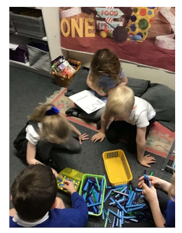
Maths – exploring, making and drawing numbers within 100