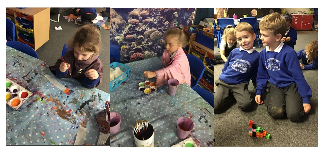
Art – adding paint to crepe paper for collage, Boolean (mental maths) creating numberblock towers to show more/less than.

In English we have been learning to recite a poem by heart, learning actions and creating masks to help us learn our poem, Fish . In Maths we have been subtracting single digits from 2digit numbers within 20 using a number track to help us solve the questions. In Art we have been focusing on collage and the artist Eric Carle. As part of our learning about Eric's art we have enjoyed listening to some of his stories too. We have used the collage skills to cut, rip, scrunch and overlay paper to create different effects. We have also explored using paint on crepe paper just like Eric does. In Phonics we have started to learn new spellings of sounds; ay, ou, ea, ie.